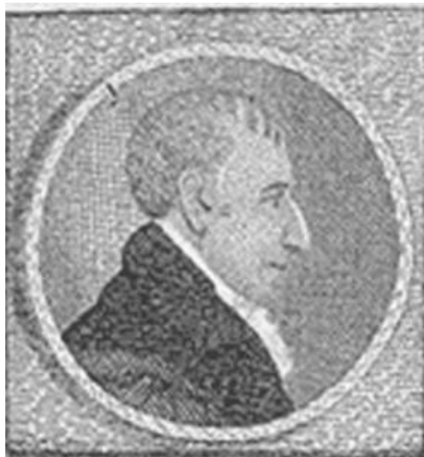
Alexander Irving, Lord Newton

Continue a few doors eastward along Heriot Row to number 27.