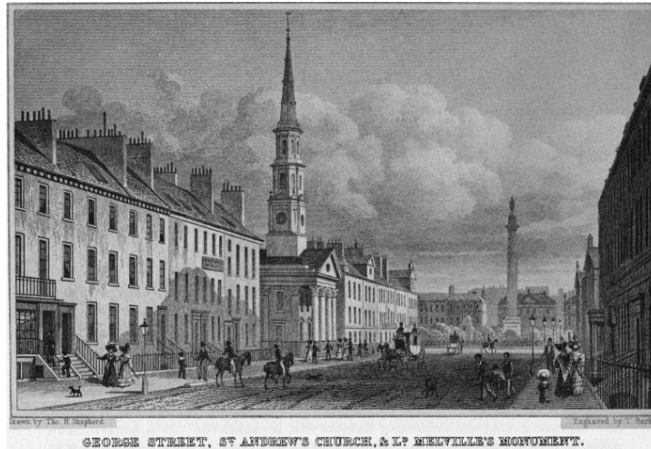
From Thos. Shepherd's Modern Athens

Continue eastward on the north side of George St for approximately 75m.