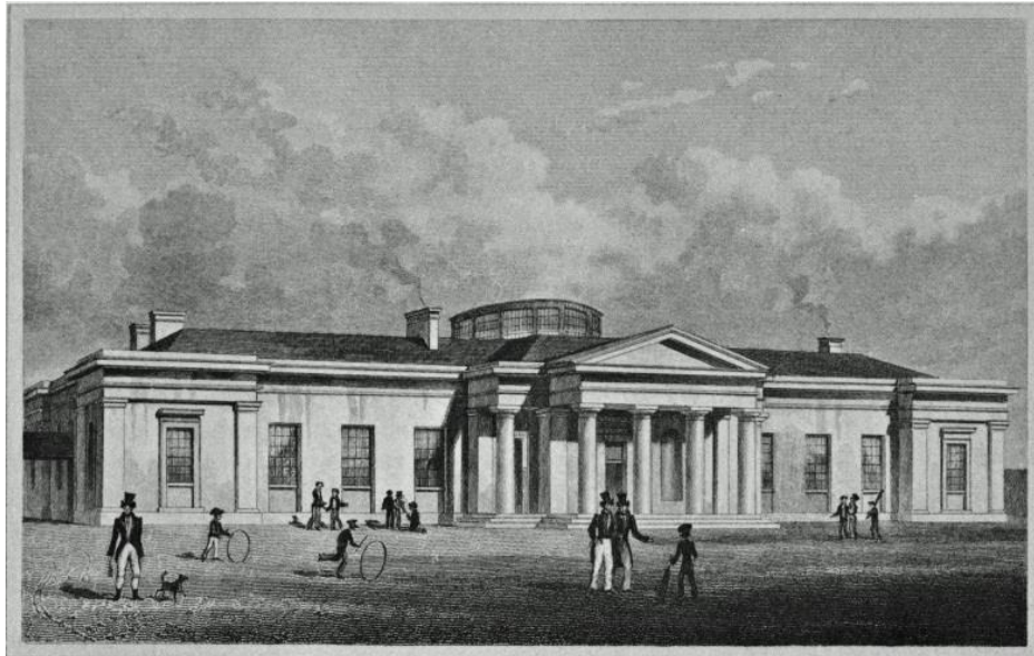
THE NEW EDINBURGH ACADEMY.

Proceed eastwards along Heriot Row to next the junction and turn left onto Howe St. Head downhill towards St Stephen's Church, then bear left along St Stephen St. Turn right behind the church onto West Silversmiths Lane, and follow it downhill onto Henderson Row. The entrance to the school is across the street, about 100m along on the right.